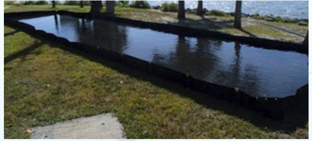
Aluminum angle Berm

The aluminum angle berm is commonly used for chemical and oil containment, frac tank containment, long term tank storage and oil drum storage.