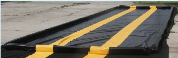
Foam Wall Berm

Foam/Air wall berm are design with for the purpose of being able to take a vehicle through the berm, without damage. The walls bend to pressure without breaking. Ground tarp are often used with these berms in case the contents of the berm escape while bending for vehicles entering. They can be made of LLDPE, reinforced PVC, XR-5, Elvaloy or Polyurethane, with a height ranging from 4-8 inches.