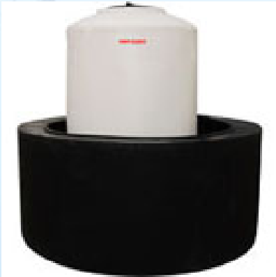
Poly spill basins

Poly spill basins are an open top sump-like containment for vertical tanks. They are made from polyethylene so they can be exposed to chemicals, have a higher resistant to UV rays and will not rust. For there size, they are light in weight and come with a handle. The basin is has sizes that run from 385 gallons up to 8,750 gallons, that they can contain. Depending on the size some of the basins may be tapered helping further control the contents.