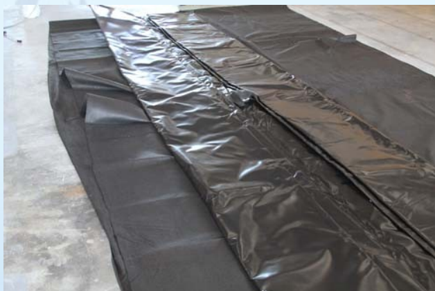
Ground Tarp/Flat Liner

Flat liners or Ground tarps are made to go under tanks and provide protection from the ground its set on. Flexible pillow tanks are recommended to have one of these tarps under it and the when used will expand the life of the tank. These tarps are also used as secondary containment for other tank and berms. Residentially they have been used under above ground pools and underlining for tents.